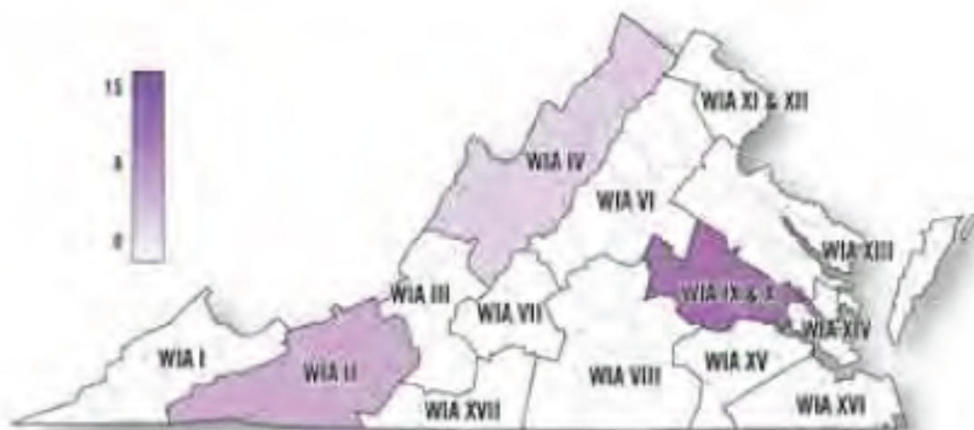
Figure 3: Chemical Equipment Operators - 2002-2012 Average Annual Openings by WIA